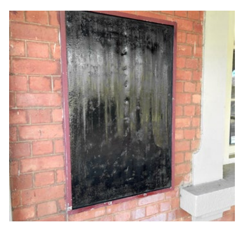
Before and after the graffiti attack. Reminder to get the phone app Snap Send Solve ... and use it.