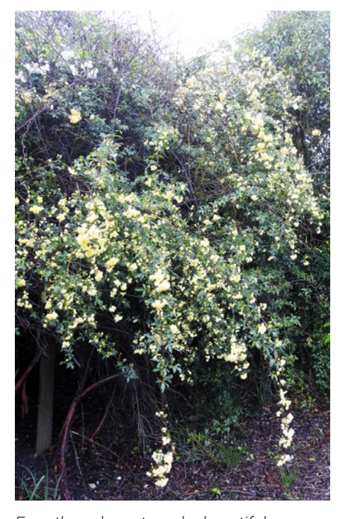
Even the unkempt can be beautiful.

or make contact by writing to Harcourt District Lions Club, P.O. Box 100, Harcourt. 3453.