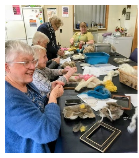
A good time was obviously had by all

'Our Craft Day in September was all about wool. At our place, we shear coloured sheep and have a great variety of colours, so making wool pictures seemed like a good idea. Armed with small photo frames, we set to work. Some simple animal shapes were provided to inspire the art. What followed was great fun as we developed our pictures and had much laughter. Teddy bears turned into frogs, birds flew away as wool was pulled, twisted and rolled to make the shapes. Fitting them back into the frames was an art in itself, but finally we had it sorted and our 'masterpieces' were ready for display.