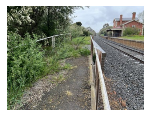
View of the existing eastern platform (on left) with environmental weed overgrowth damaging heritage infrastructure behind it.

is now overgrown with environmental weeds, mainly tagasaste, commonly known as tree lucerne. A number of historical elements remain, but are being damaged by the weed roots. Removing the weeds will uncover the historical site and give a fabulous view of the station building from Coolstore Road. Removing the weeds will also give access to the platform so the station can be active again.