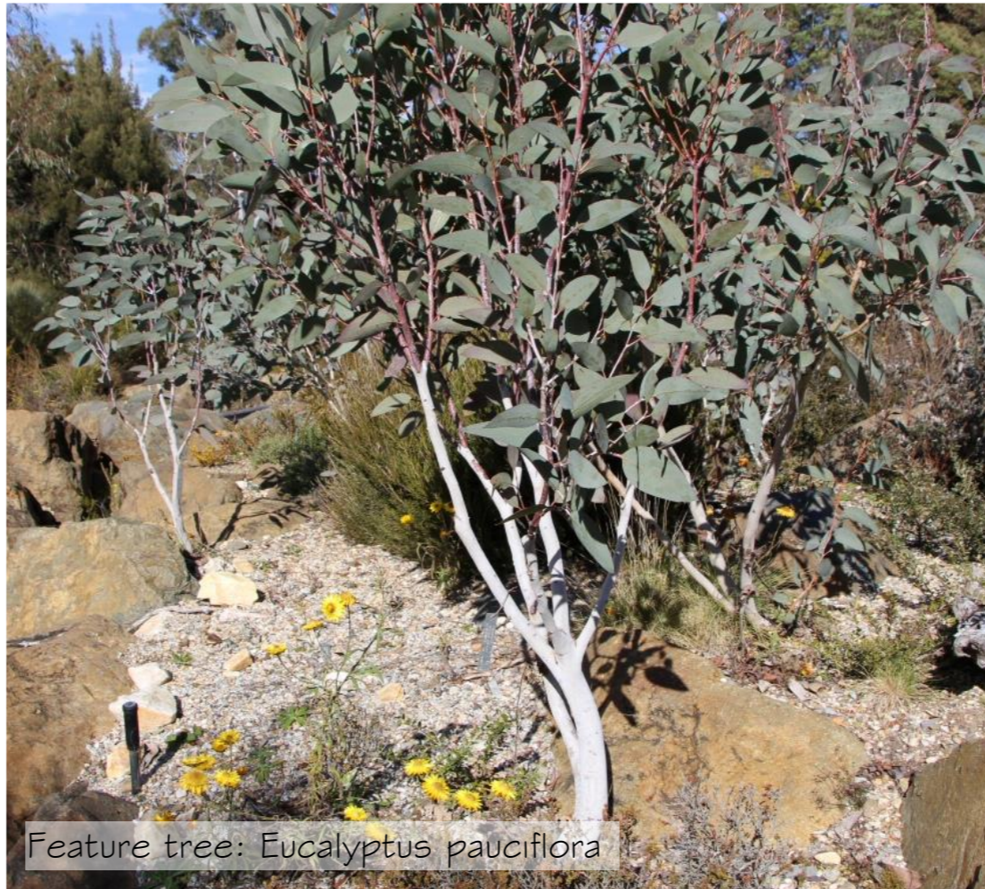
Feature tree: Eucalyptus pauciflora