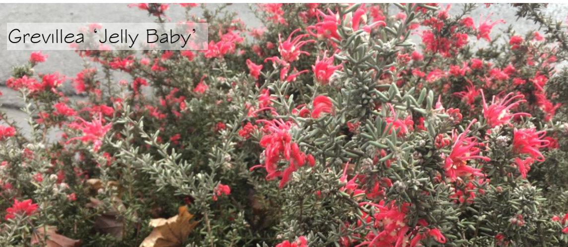
Grevillea 'Jelly Baby'