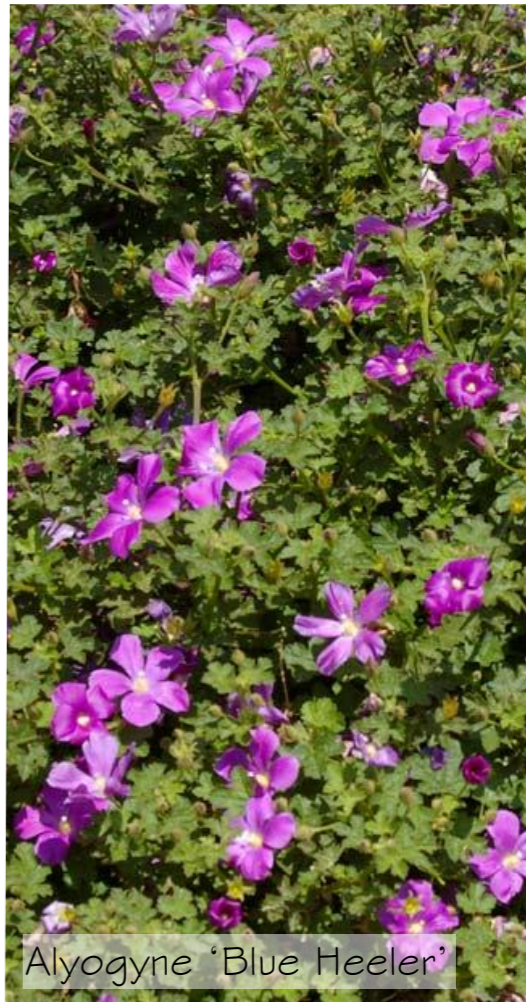
Alyogyne 'Blue Heeler'