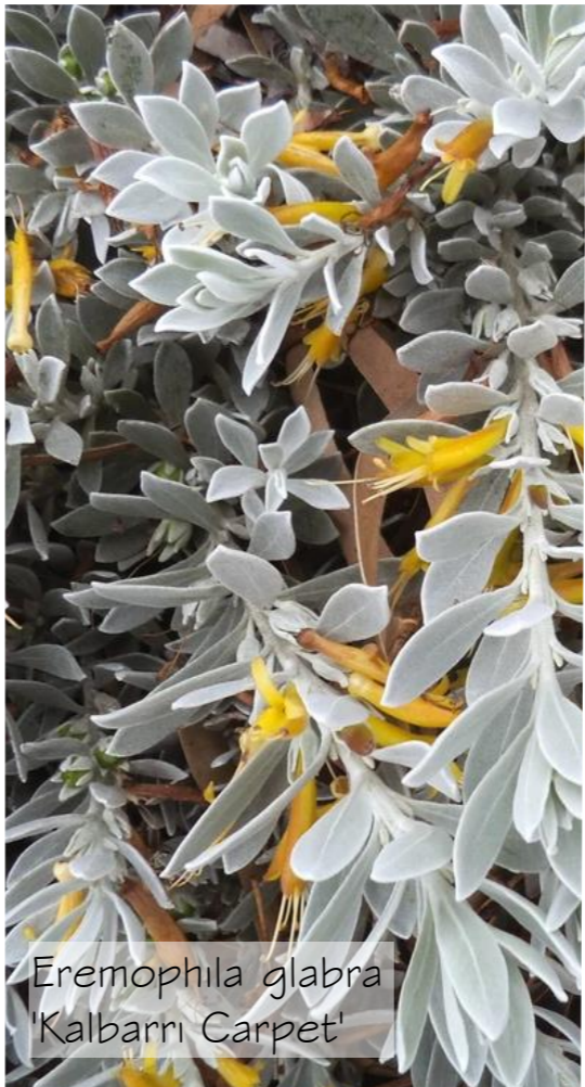
Eremophila glabra 'Kalbarri Carpet'